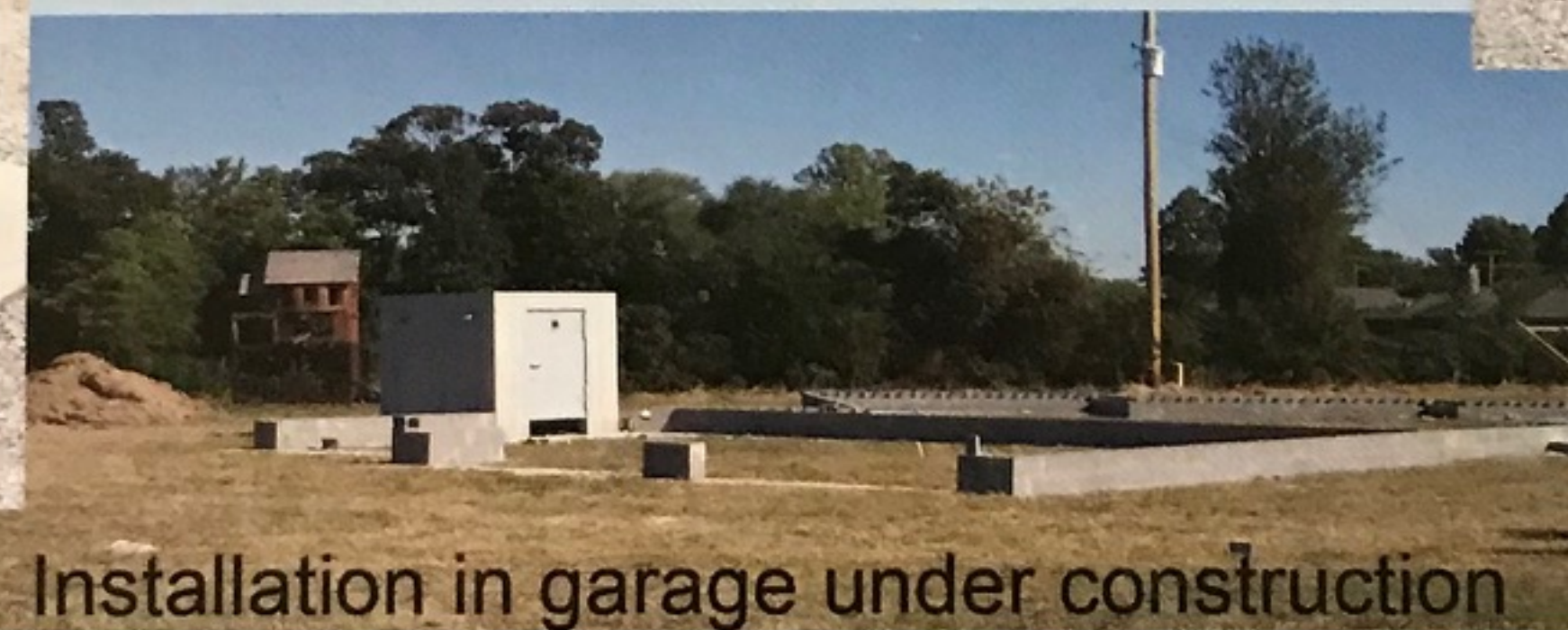
Installation in garage under construction

Indoor installation available on new construction